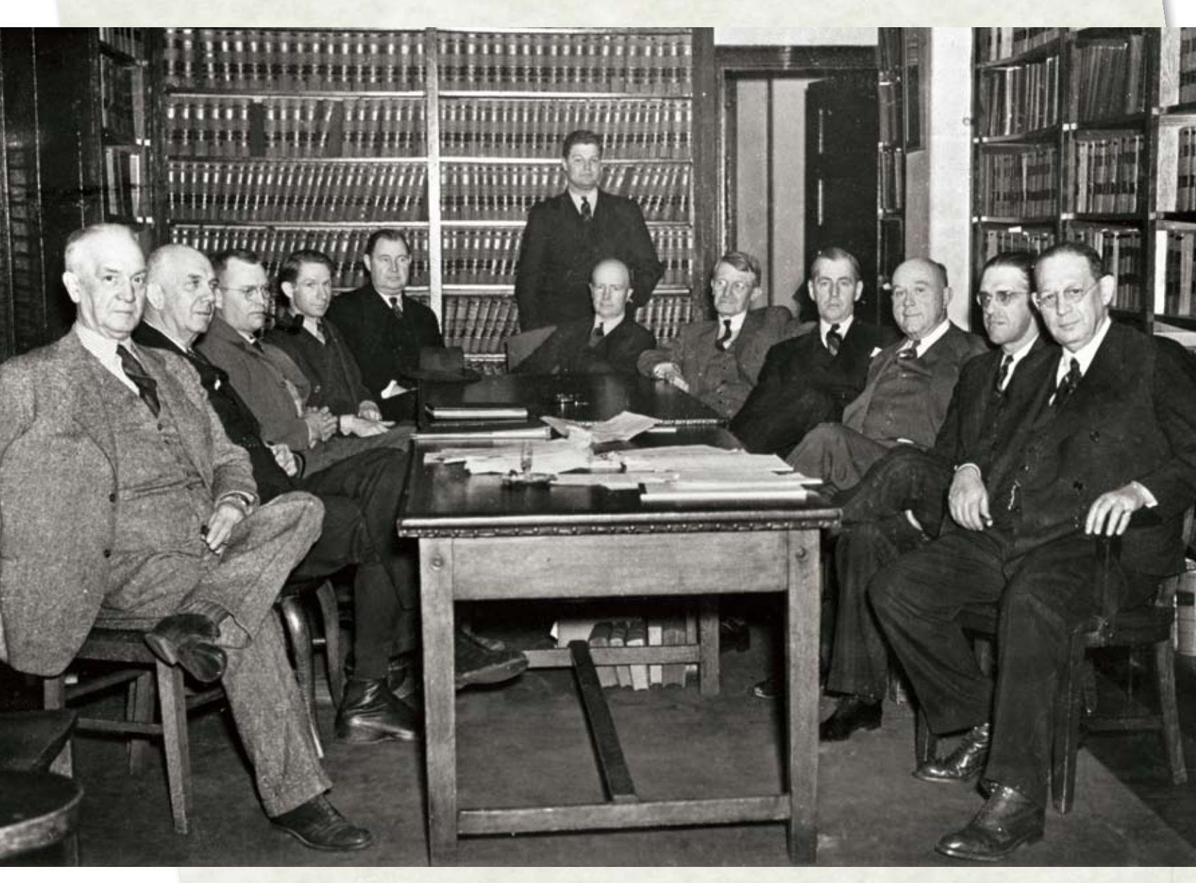
Keeneland's first board of directors; opposite, the original prospectus